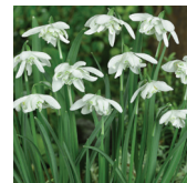
Galanthus (Snow drop)