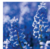
Muscari (Grape Hyacinth)